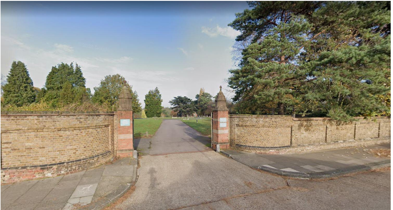
Entrance to Woolwich Old Cemetery with Chapel in background

Woolwich Old Cemetery, London has 179 Commonwealth War Graves – 98 relating to World War One & 81 relating to World War Two. There are 3 Australian WW1 War Graves located in this Cemetery.