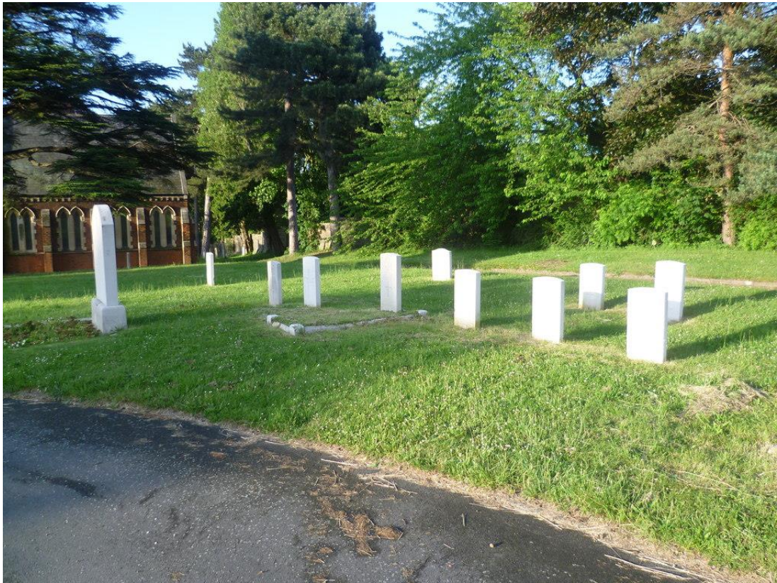
War Graves in Woolwich Old Cemetery (Photos by Ian Yarham – above June, 2012; below July, 2021)