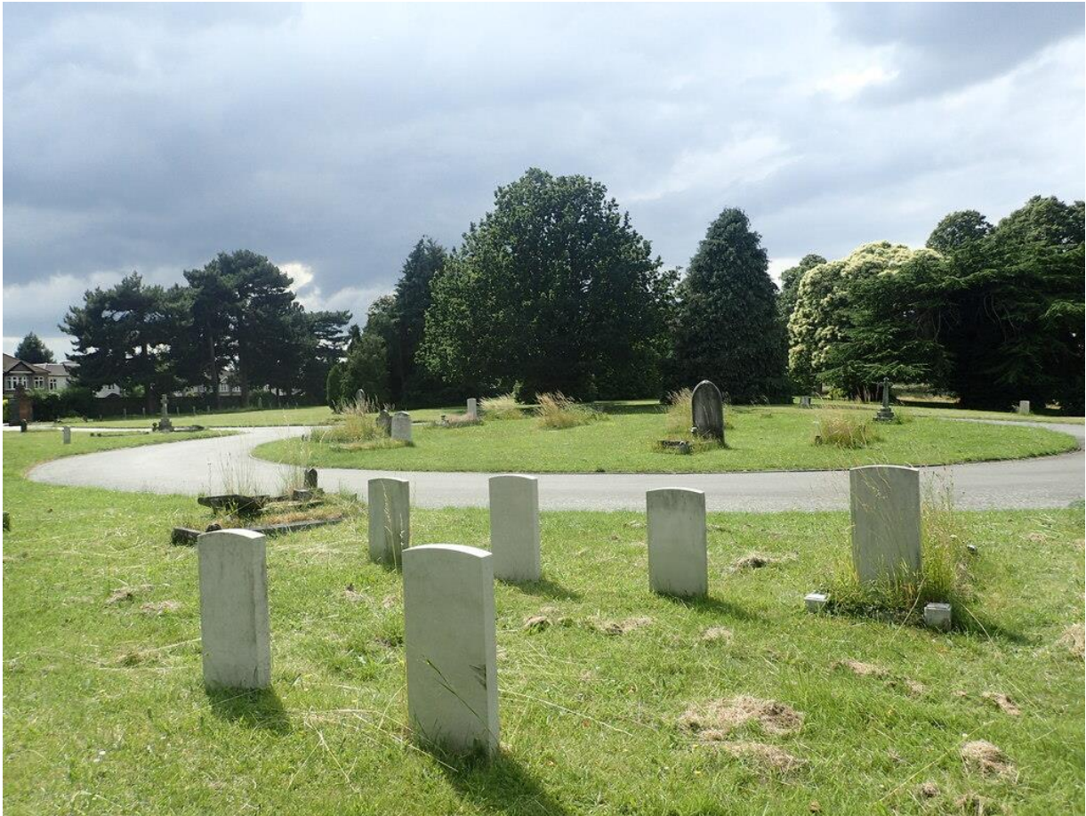
War Graves in Woolwich Old Cemetery (Photo by Ian Yarham – July, 2021)