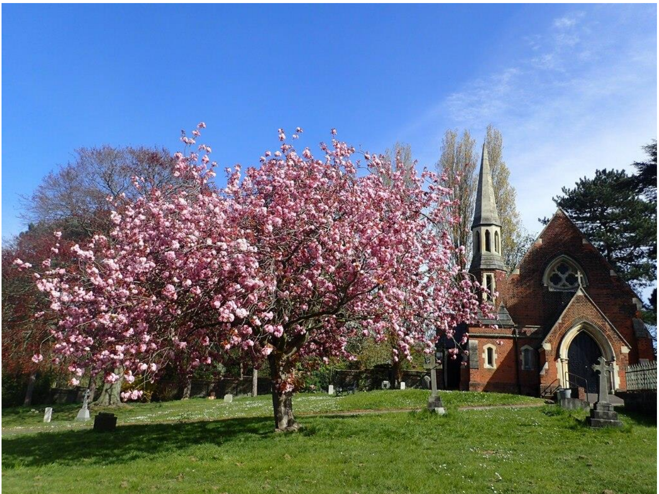
Chapel in Woolwich Old Cemetery